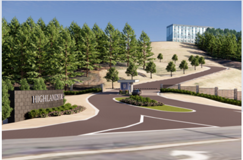
Rear entrance security rendering

Campus enhancements will improve the student experience by expanding the current campus footprint and increasing security, including controlled access.