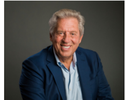
DR. JOHN C. MAXWELL Founder, Maxwell Leadership